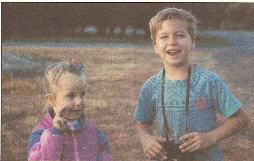
Watch the excitement of children as they look forward to a day of exploring.

Description: A multi-purpose paved road leads to an elevation of 934 ft. The road can be used for walking, but other hiking trails are available. A covered viewpoint provides a spectacular look at Skagit Valley, San Juan Islands, Olympic Mountains, and the tulip fields.