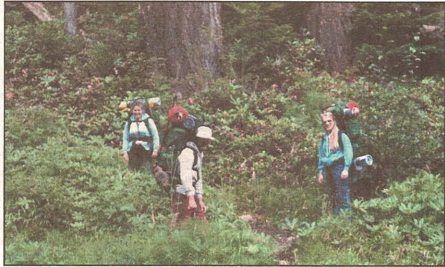
Hiking with friends and family make for a fun and healthful outing.

Description: Surrounding and including Cranberry Lake, Heart Lake, Mt Erie, and Whistle Lake is 2,200 acres of forest, wetlands, lakes, and mountaintops. Trails are open to hikers, horseback riders, and cyclists year-round. To avoid confusion, a map of